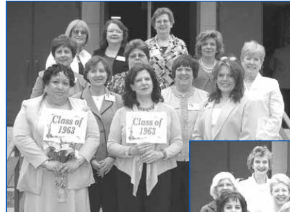
45th ANNIVERSARY Class of 1963