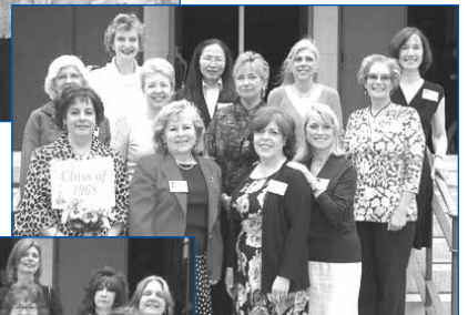
40th ANNIVERSARY Class of 1968