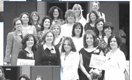
30th ANNIVERSARY Class of 1978