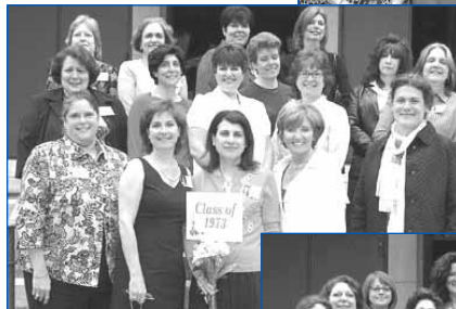
35th ANNIVERSARY Class of 1973