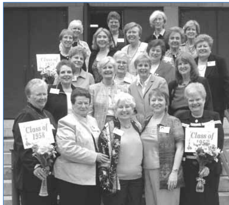
50th ANNIVERSARY Twenty members of the Class of 1958 gather outside SCA auditorium.

25th ANNIVERSARY Eight members of the Class of 1983 returned for the celebration.