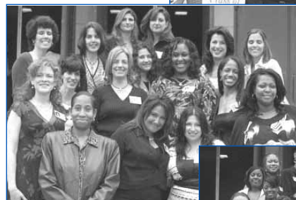
20th ANNIVERSARY Class of 1988